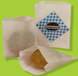
SNACKS PAPER POUCH