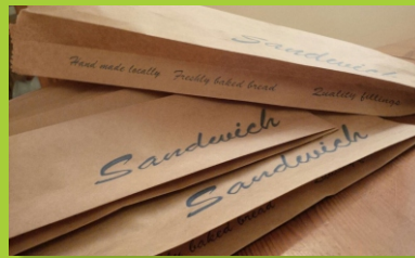
SANDWICH PAPER BAG